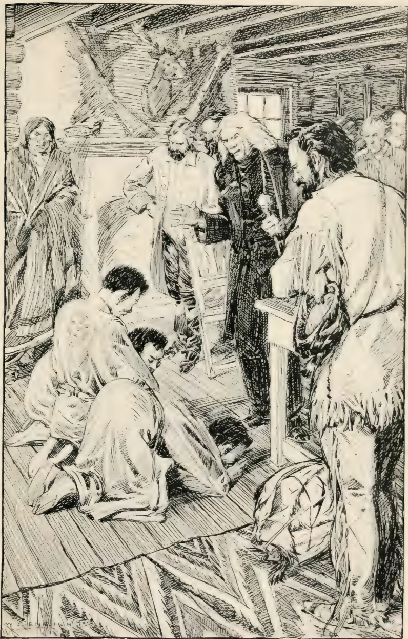
“ The little brown men had thrown themselves on the floor.”